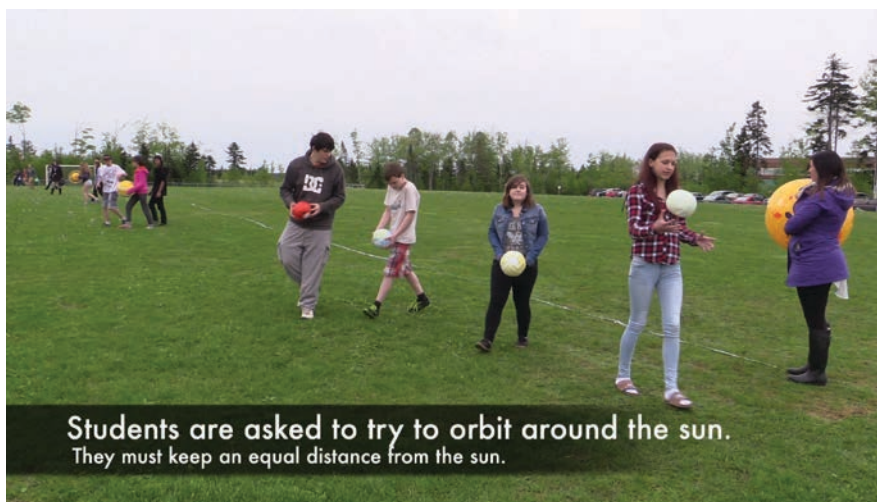
FIGURE 1: Solar system kinulation

The process of developing kinesthetic simulations as explanatory teaching models in your classroom is a relatively simple endeavor and involves the following steps: